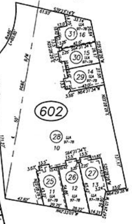
DETAIL - A SCALE: 1" = 60'

NOTE: This Map Was Prepared For Assessment Purposes Only, No Liability Is Assumed For The Accuracy Of The Data Delineated Hereon.